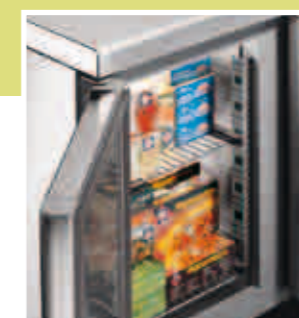
Vano GN1/1 GN1/1 room