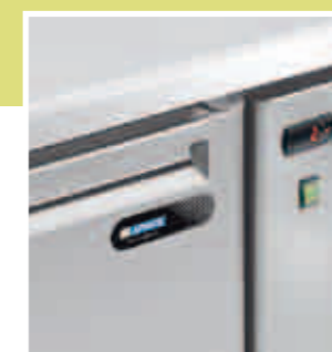
Pannello di controllo per modelli predisposti senza gruppo Control panel for models without unit