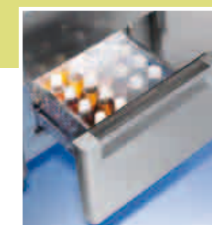
Profondità utile dei cassetti GN1/1 (1/3=cm 12, 1/2=cm 23, 2/3=cm 34) Usable depth of the GN 1/1 drawers (1/3=cm 12, 1/2=cm 23, 2/3=cm 34)